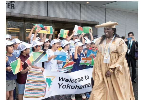
Local children greet arriving African leaders

Starting with its 8 sister cities, including San Diego (USA) and Shanghai (China), Yokohama has established relations with cities around the world. In addition, large-scale conferences and other events provide opportunities for citizens to take part in international exchanges. These connections lead to deeper cultural understanding and initiatives that drive mutual growth.