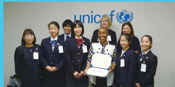
Yokohama Student Peace Messengers meet Deputy Executive Director of UNICEF

Yokohama's Board of Education invites children in elementary and junior high schools to take part in the Yokohama Children's International Peace Speech Contest, and the winners selected by the mayor travel to the UN headquarters in New York to represent the city as Yokohama Student Peace Messengers.