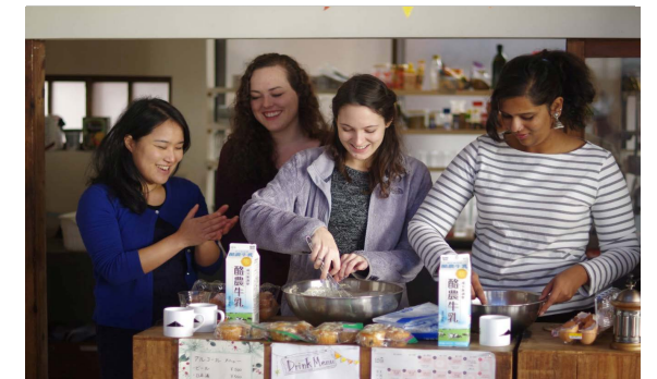
Cultural exchange space CASACO bridges generations, cultures

As the number of non-native residents continues to grow past the 100 thousand mark, Yokohama pursues efforts to realize a multicultural society by helping build inclusive and safe communities that respect the cultures and customs of people of diverse backgrounds.