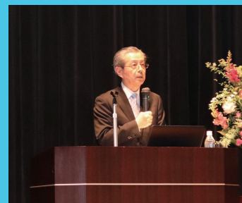
Secretary General of Mayors for Peace speaks at a seminar in Yokohama

As a member city, Yokohama has invited the Secretary General of Mayors for Peace to a public speaking event and organizes exhibitions of posters advocating for the abolition of nuclear weapons.