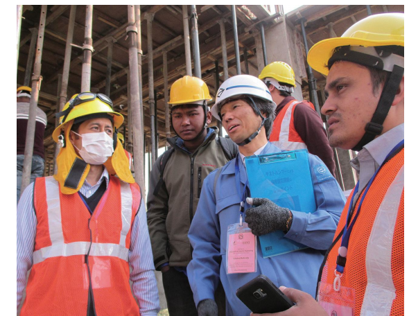
Yokohama supports post-earthquake reconstruction in Kathmandu

Home to the offices of various UN organizations, as well as JICA and other international institutions, Yokohama works with those groups to help developing countries with disaster prevention measures. Additionally, the city's Y-PORT Project promotes international technical cooperation through public-private partnerships, taking the expertise of local businesses and applying it to the sustainable urban development of cities in emerging economies.